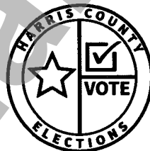
Elections Administrator Harris County, TX